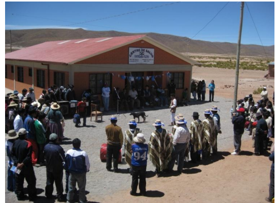
Clinic dedication - Candelaria de Viluyo

As part of our integrated approach to community development, Mano a Mano also constructed sanitation, teacher housing, and schools in three communities.