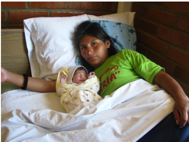
Mother with newborn child