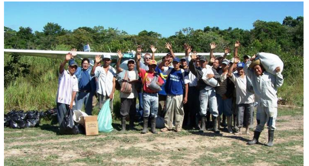
Flying food supplies to the Beni

In Bolivia, getting around is very difficult. Roads, which are in very poor condition to begin with, wind up and down the Andes Mountains and often require 4x4 jeeps. In the tropical lowlands to the East, roads are often nonexistent, limiting transportation to river boats or walking to larger cities. In emergencies in these rural areas, it may take people hours or even days to get access to medical care when they need attention immediately.